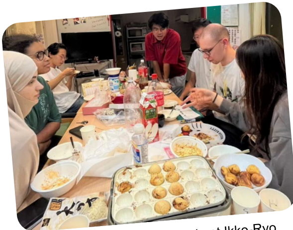
Takoyaki party at Ikko-Ryo Festival

My exchange semester at IPP was the best experience of my master's studies. I chose the IPP because, as a student of international affairs, I found it attractive to be able to choose from a wide range of courses in this discipline. I found the courses related to Japan's security and foreign policy particularly exciting, as such courses are rarely offered in Europe. In addition to the academic aspect, I really enjoyed spending time with my fellow students at HU. I loved living in the Residence Hall Ikkyo-Ryo and organizing intercultural events together with my floor mates. My semester at IPP gave me completely new insights both academically and culturally, which will certainly be helpful for my international career.