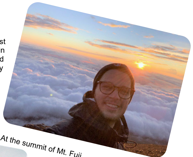
At the summit of Mt. Fuji