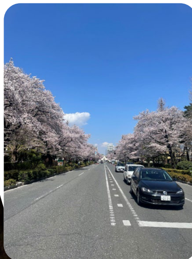
Daigaku-dori University Street